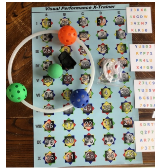
Pickleball Training Kit

This product is so new it hasn't made it to our website yet. If you are a Pickleball player, and it seems that everyone is, you will definitely benefit from using this kit. If you are interested in hearing more you will need to e-mail to htsskeeter@gmail.com for more information. We look forward to hearing from you.